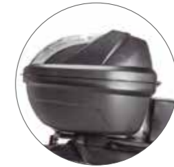
Rear box 47L