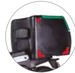
Cargo box 200L