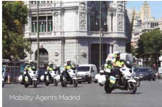
Mobility Agents Madrid