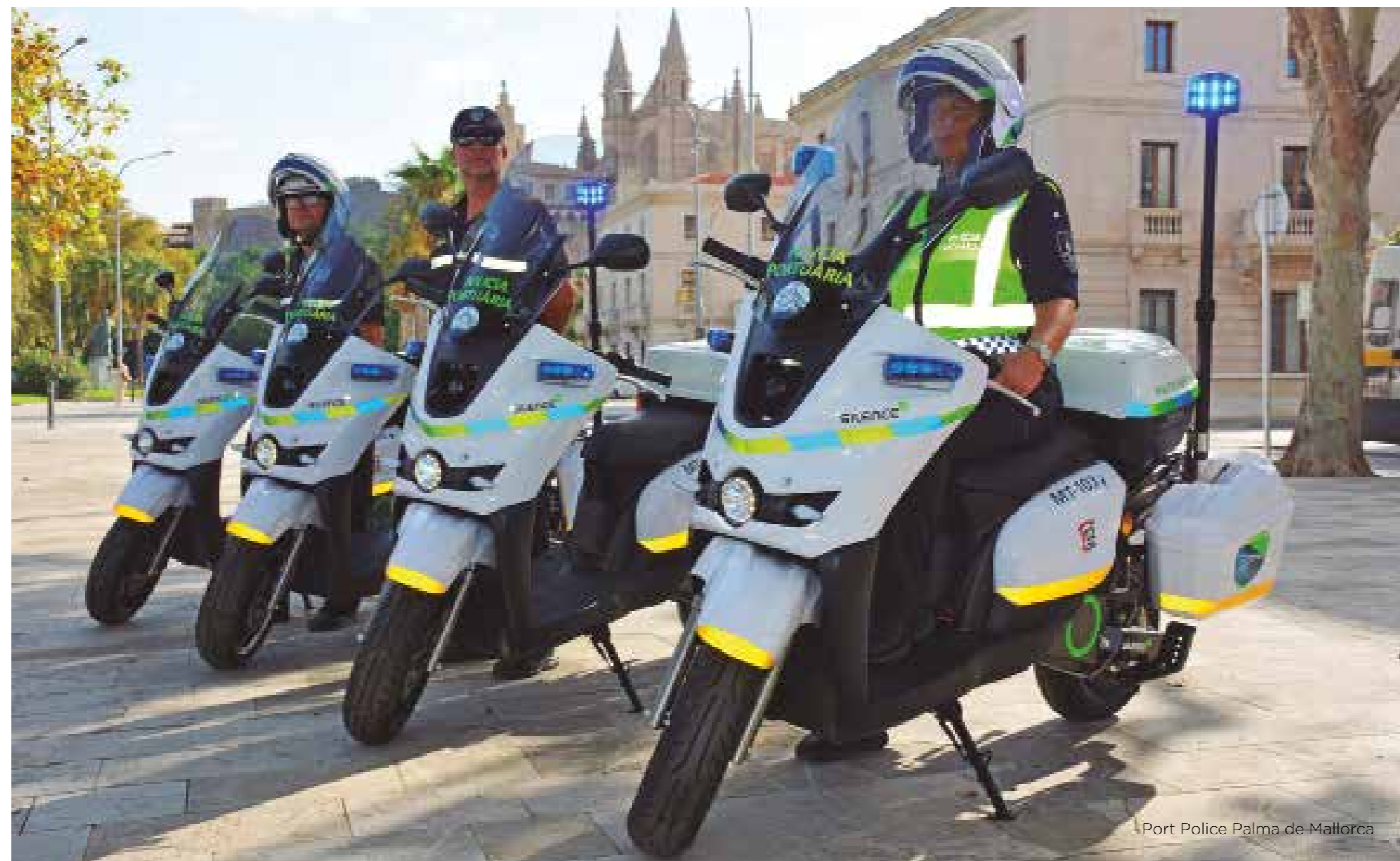
Port Police Palma de Mallorca